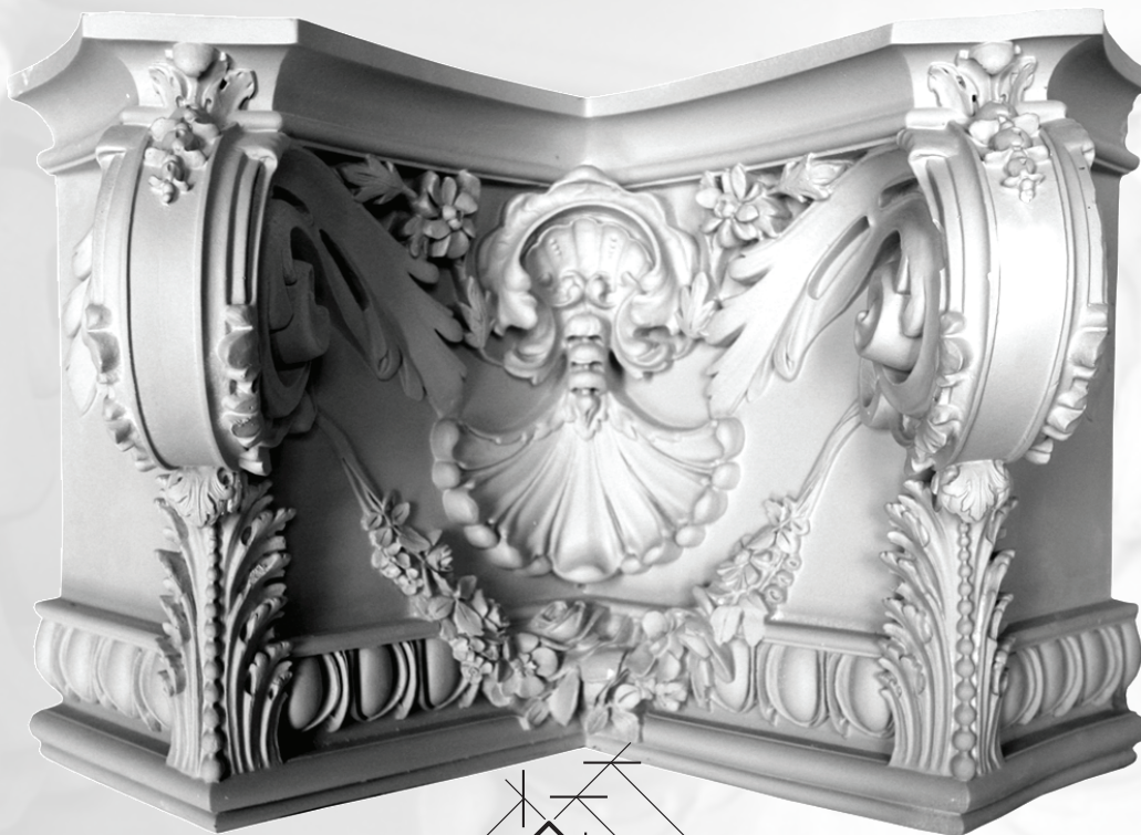
FRONT VIEW NOT TO SCALE