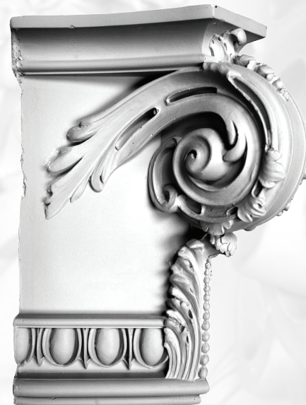
PLAS 847 C