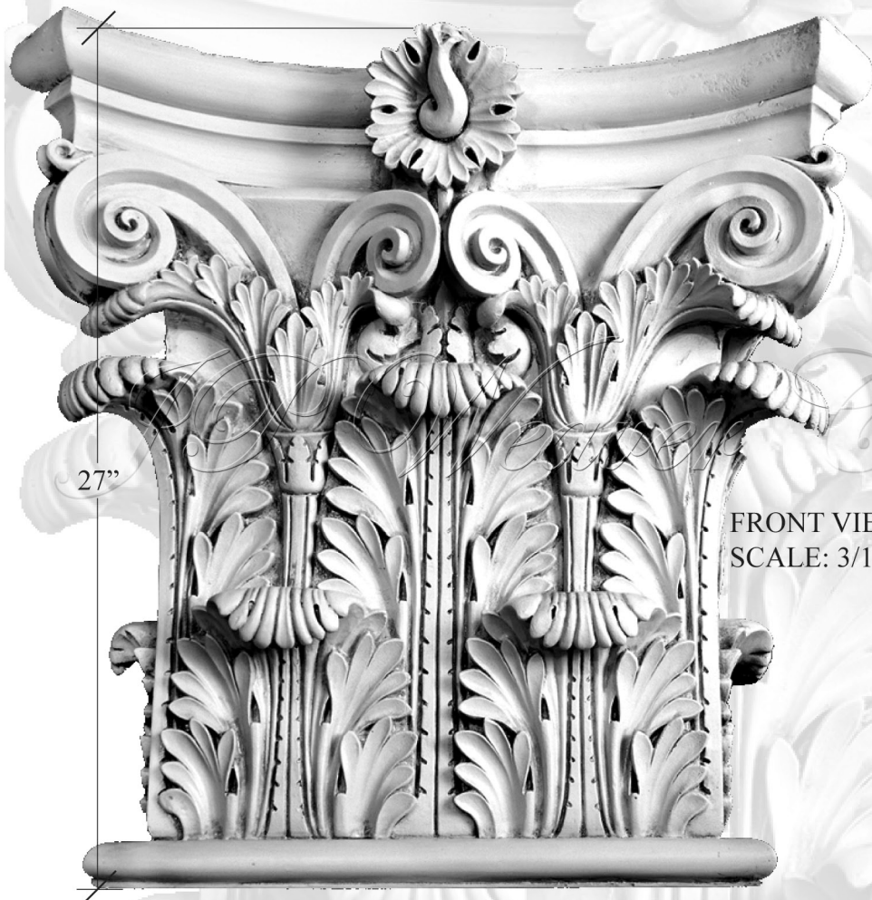
FRONT VIEW SCALE: 3/16" = 1"