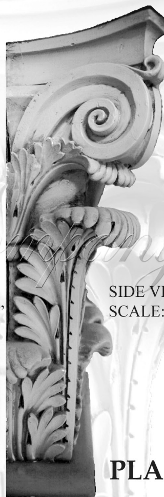
SIDE VIEW SCALE: 3/16" = 1"